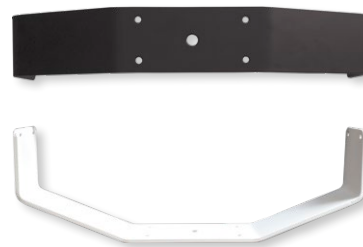
Heavy Duty U-Bracket