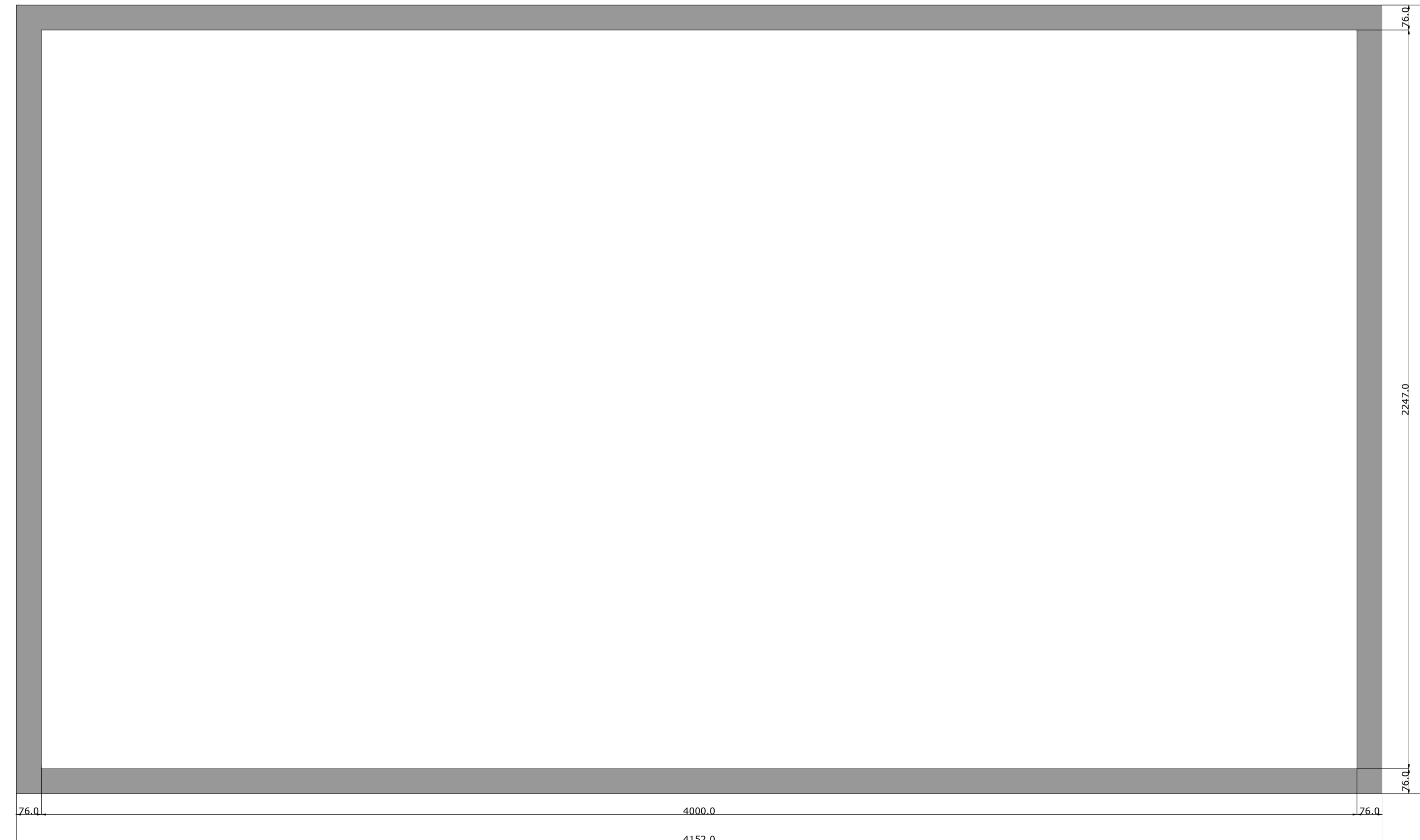
02 ELEVATION A- CSB-HALO-WIDE-4.0 - 1.78